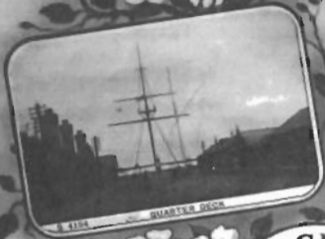
S. 4104 QUARTER DOCK