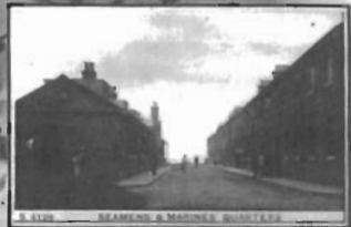
S. 4109 SEAMEN & MACHINES SHEDS