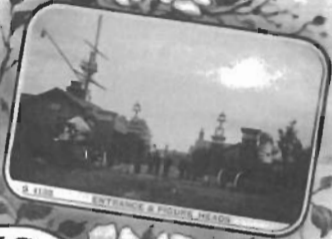
S. 4106 ENTRANCE & FISHING HEADS