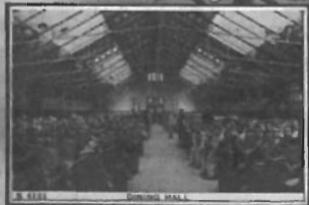
S. 4107 DINING HALL