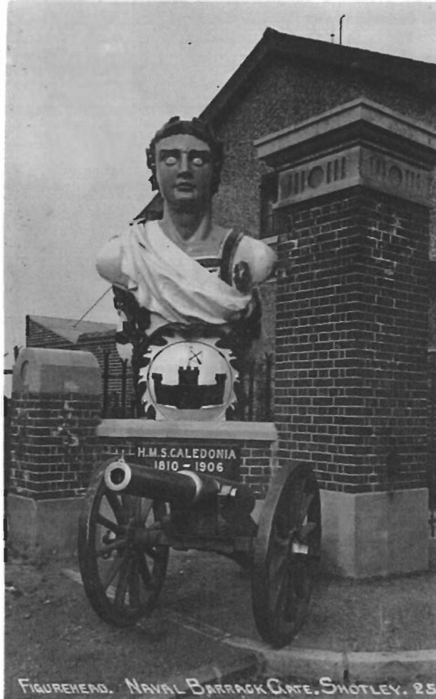
FIGUREHEAD. NAVAL BARRACK GATE, SHOTLEY. 25