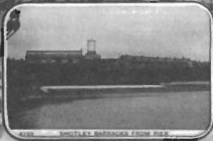
S. 4108 SHOTLEY BARRACKS FROM PIER