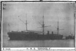
S. 4105 H. M. S. "GANGES II"